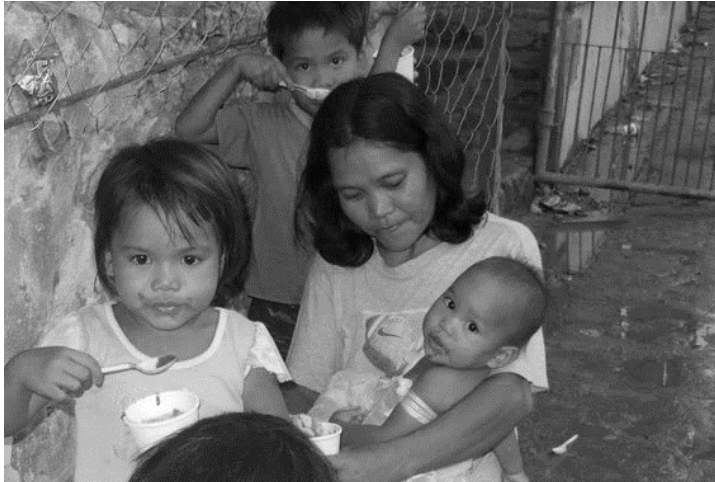
Poverty and hunger