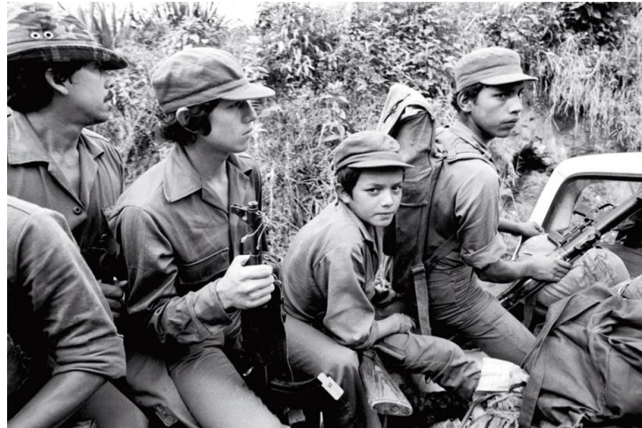
War and violence